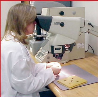
Mantis Scope visual inspection guarantees quality and consistency.